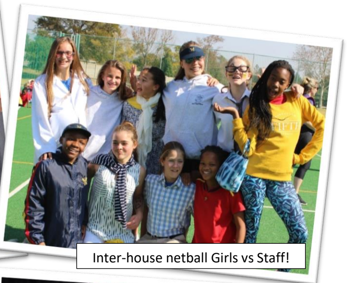
Inter-house netball Girls vs Staff!