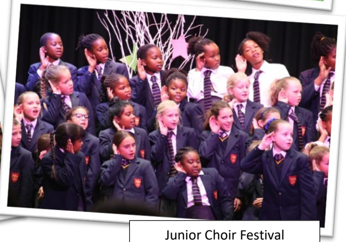
Junior Choir Festival