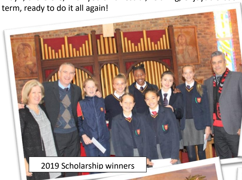
2019 Scholarship winners

May I, therefore, wish you all a restful, relaxing, enjoyable but most of all SAFE August holiday!! And return next term, ready to do it all again!