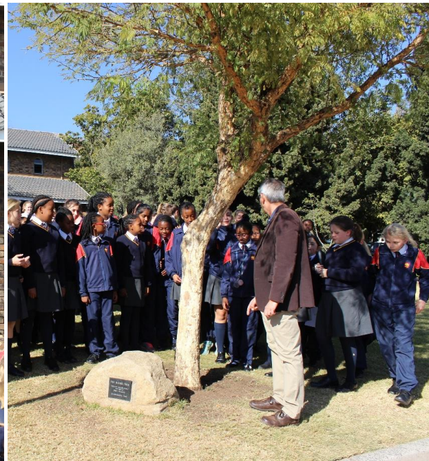
A beautiful service was held in memory of Nelson Mandela today, 18 July, at the Madiba Tree!