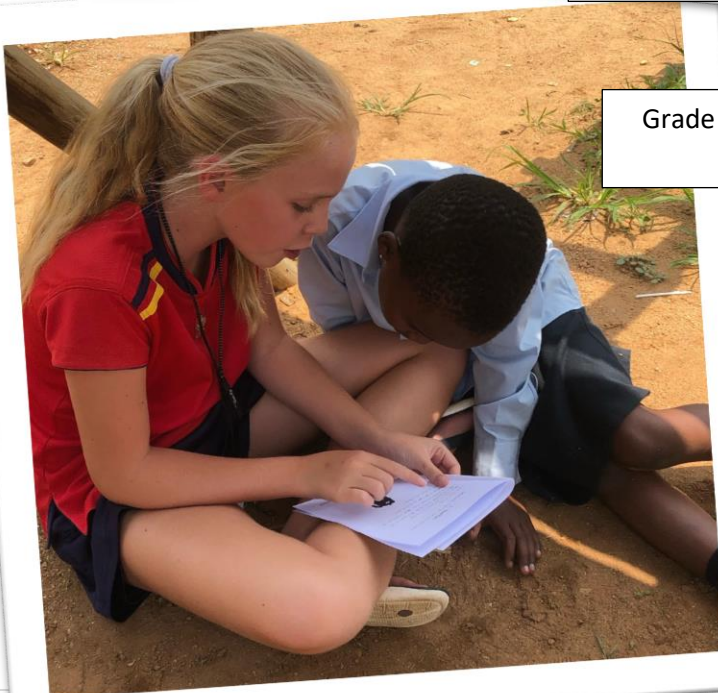
Grade 6 girls read with the Sefikeng Grade 2 children