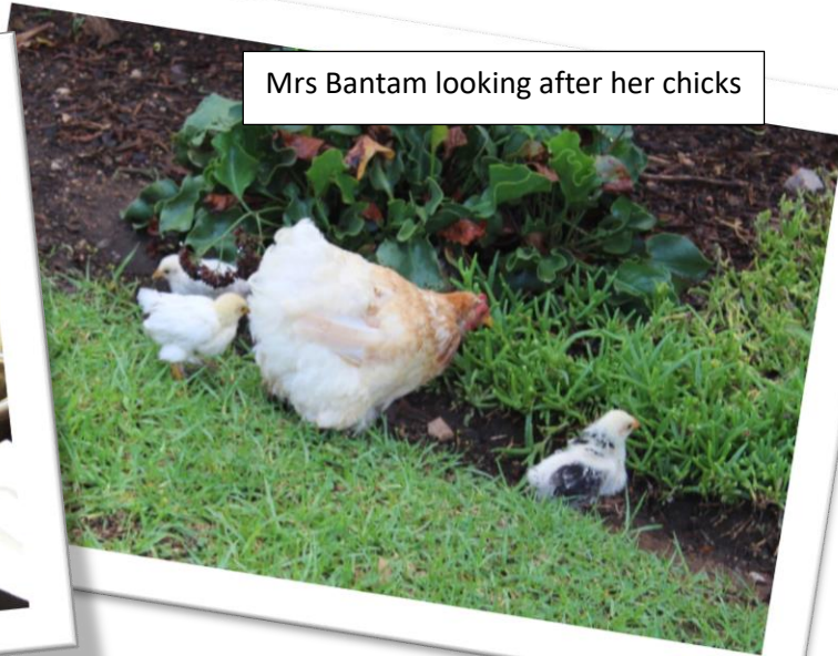
Mrs Bantam looking after her chicks