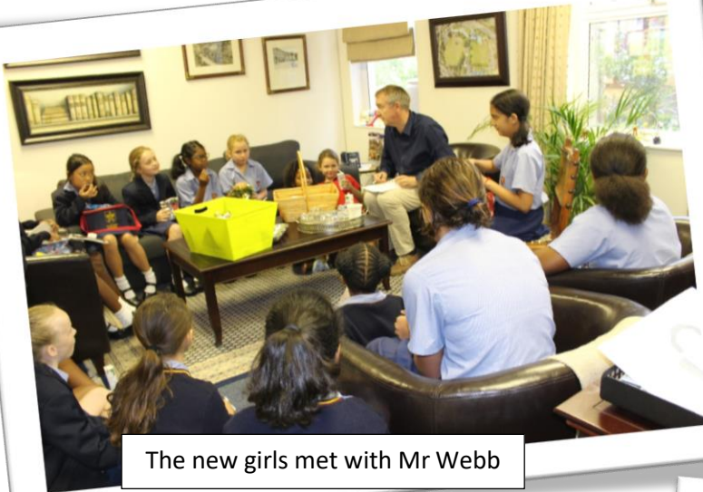
The new girls met with Mr Webb