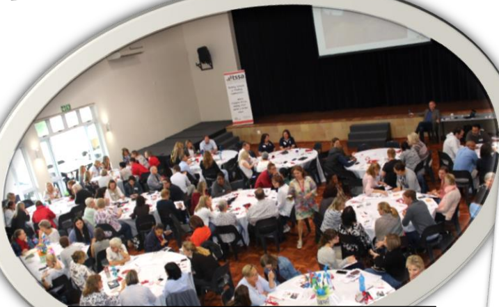
Thinking Schools South Africa (TSSA) conference held at St Peter's