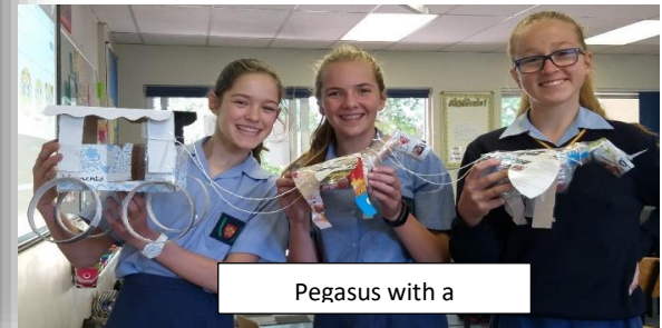
Pegasus with a

The cardboard challenge was a powerful tool, which fostered and advanced many facets of learning through play. Such a fun Teachers' Day for all!