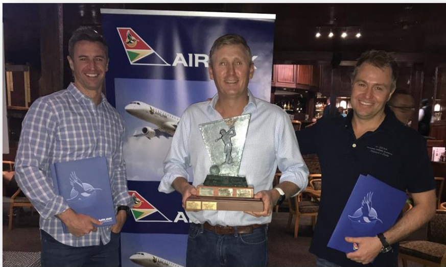
Golf Day winners! Congratulations!

Thank you once again to all the golfers and sponsors for your incredible support, which ensured that the day was such a success!