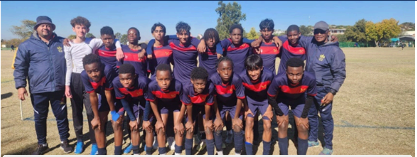
The Boys u15 Team winning the Plate section at Brebner High