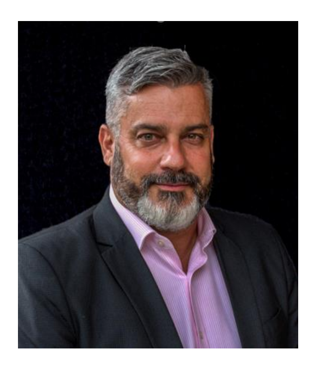
Dear St Peter's College Staff, Parents and Students,

As we approach the end of our first term at St Peter's College, I find it fitting to take a moment to reflect on the accomplishments we have achieved, to update you on important changes and to express my anticipation for an even more successful Term 2.