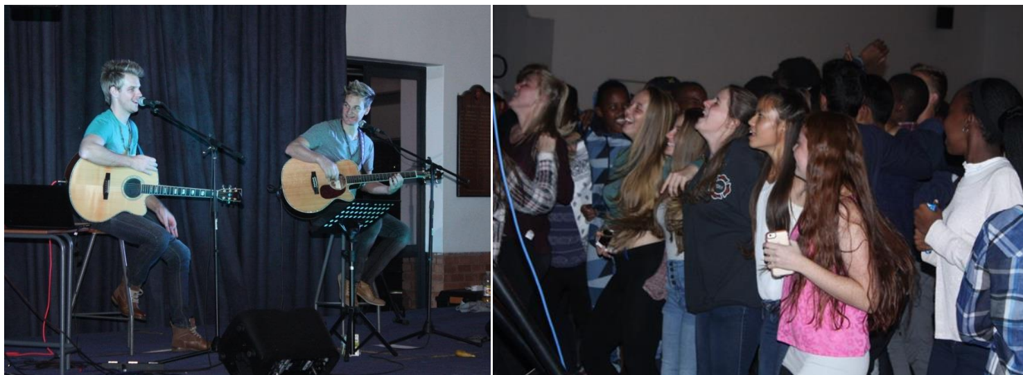
The band was a great hit at the College back in 2015

All staff as well as the Grade 8 and 9 parents are invited to join the students. The event will be in the same format as a night at the Barnyard Theatre. Families are welcome to bring their take-away dinners and non-alcoholic drinks along and have dinner while being entertained by the talented band. The evening promises to be very entertaining with a few surprises during the performance... The event will finish no later than 21:00