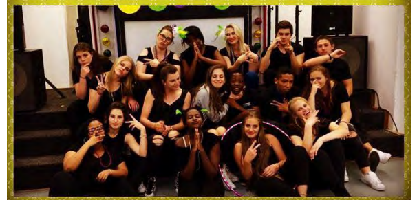
Our effervescent Matric Dance Committee (MDC)