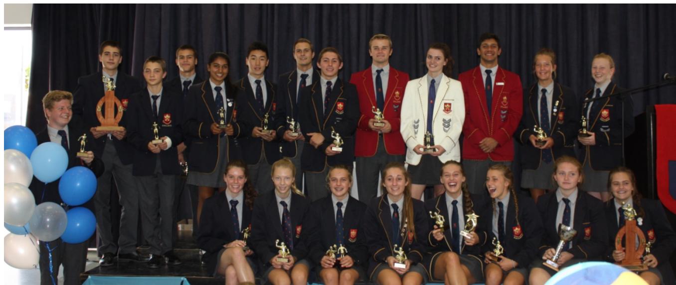
Well done to all swimmers and water polo players who were awarded trophies at the Annual Aquatics Brunch on 1 April 2017