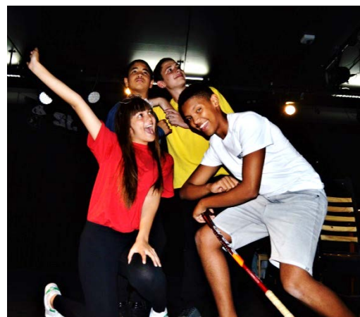
The Cameo Cast: Outside