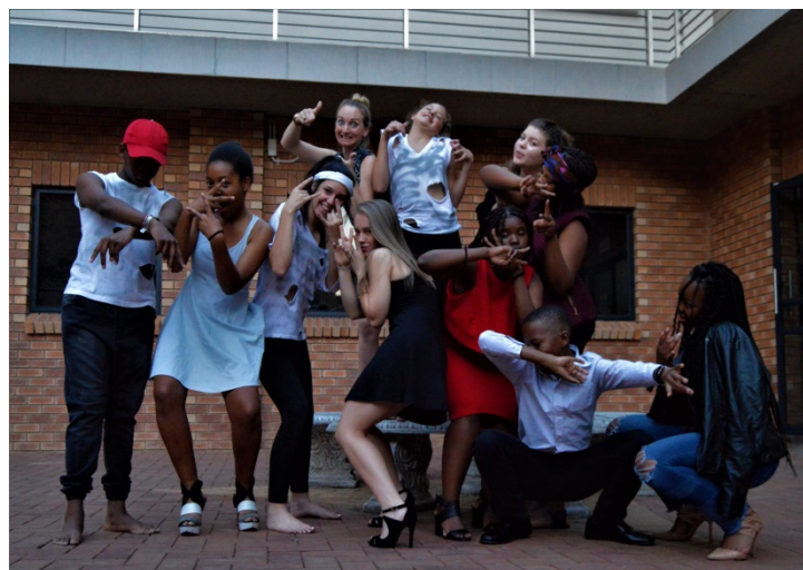
Some of the Gr10 directors