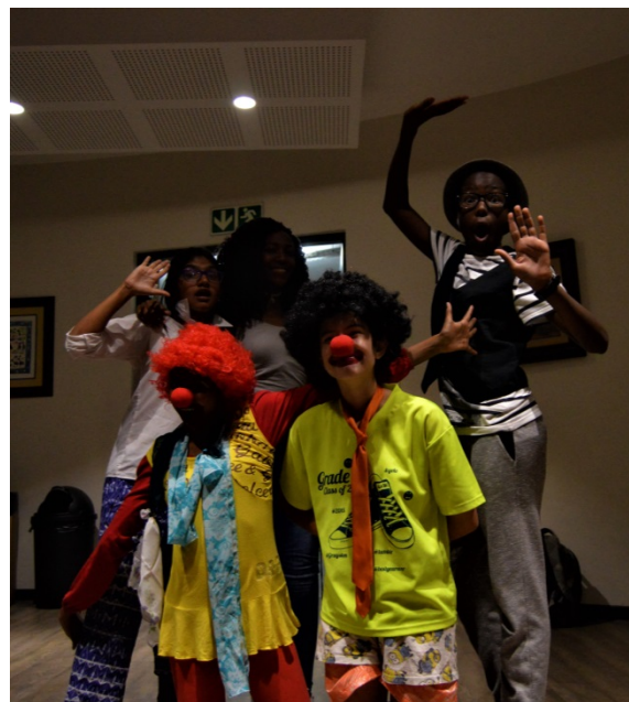
Send in the clowns!