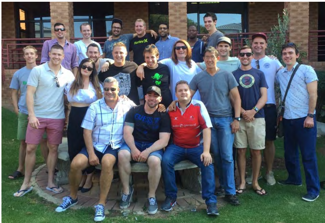
Some Old Pets at the St Peter's College Class of 2006 10 Year Reunion

I also had the opportunity to attend the Class of 2006's 10 th year reunion at the College; it is always wonderful to catch up with the alumni and to see how they are all achieving in a number of fields. It is wonderful to see the pride that they all still have in their College.