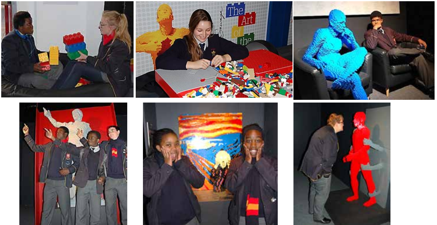
"Dreams are built one brick at a time" (Nathan Sawaya)

The art enthusiasts were fortunate to engage with this popular and much praised world class exhibit on 24 June 2015. The exhibition was amazingly sculptural despite the medium of all artworks on display; the modest and simple LEGO brick.