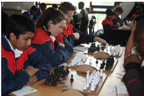
Chess masterminds at work