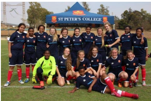
1st Team Soccer Girls

St Peter's also played exceptionally well, definitely kicking the season off on the right foot! The netball courts had plenty of action too. Unfortunately, the tournament was cancelled due to the wet weather. This meant that there were no final games but the winner of each pool shared the trophy ie. Krugersdorp High and Prestige College.