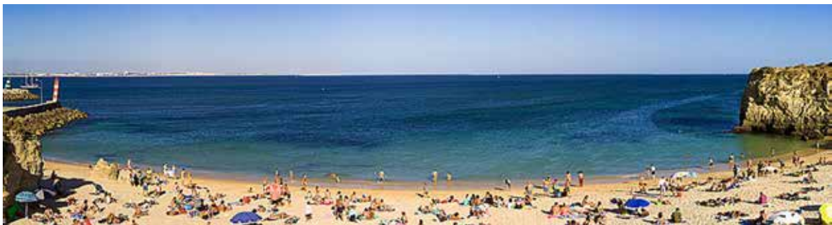
Tennis Tour 2016: Portugal, Algarve, Praia da Luz, Luz Bay Hotel