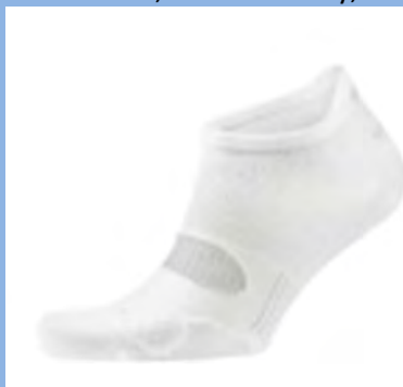
Hidden Dry Socks – R35 per pair – suitable for Athletics, Cross Country, etc.