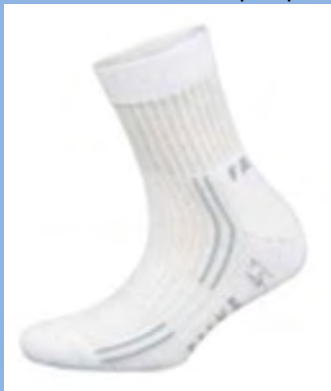
Netball Socks - R50 per pair