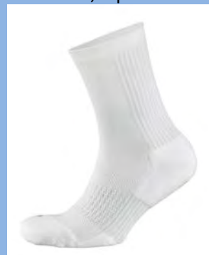
Racquet Sports Socks – R20 per pair – suitable for Tennis, Squash and Basketball