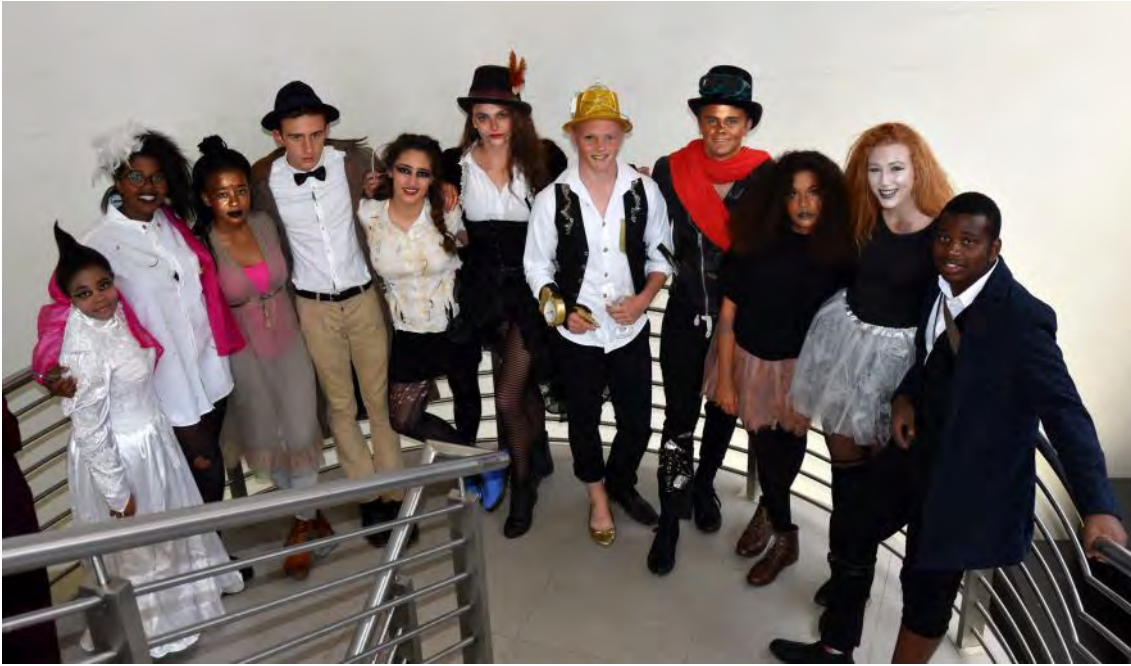
The Grade 11 Drama students before their Drama practical exam on Wednesday, 29 June. The theme was 'Steampunk'.