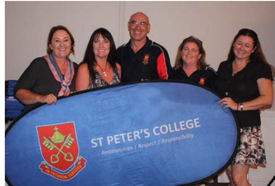
Thank you Golf Committee