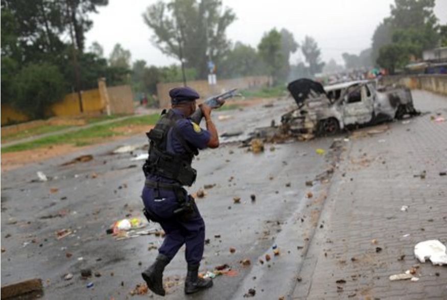
A South African police officer fired rubber bullets at people in Zandspruit, a settlement west of Johannesburg, after protests and looting there.