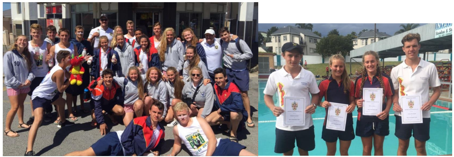
Well done to all our boys and girls