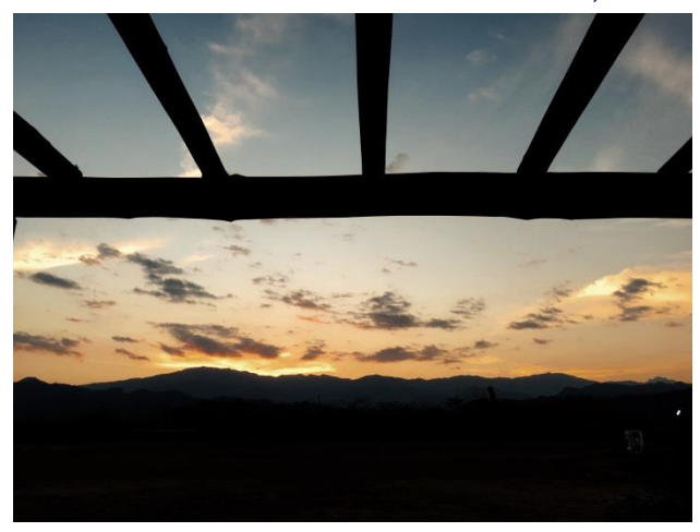
The view is of the mountains right outside my house