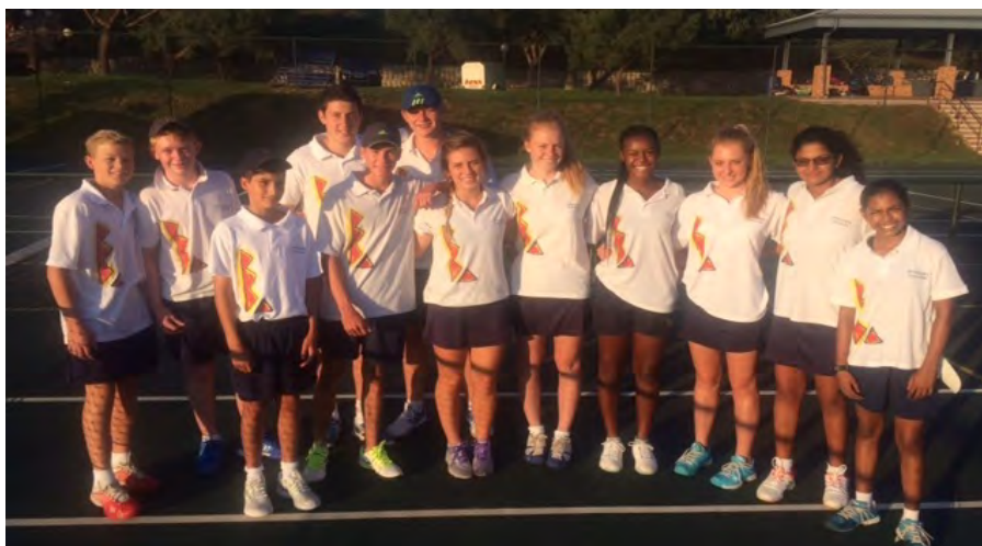
The weekly 6 o'clock training for the first team Girls and first team Boys

Many thanks again Cornel and Ben for all you do in the name of tennis.