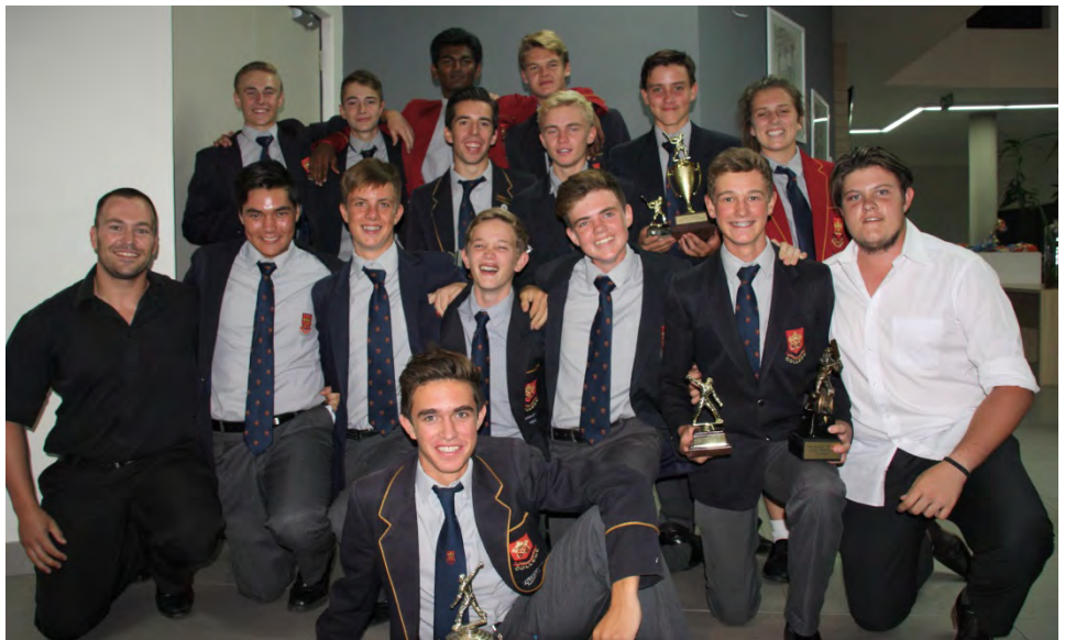
2016 Annual Cricket Dinner Celebrations