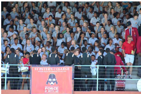
The force was with us! Thanks to all the supporters!