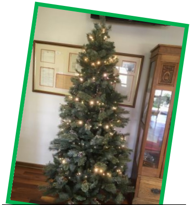
THE CHRISTMAS TREE IS UP!

Exams are an important part of academics, but that being said, it is often a time of stress and anxiety that one would rather do without. The word 'examination' alone tends to send shivers down our spines and brings about a