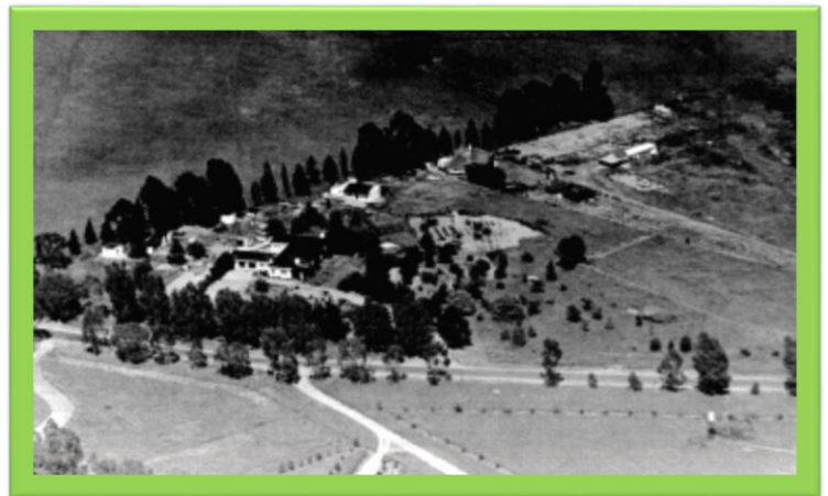
An aerial view of the school in 1951