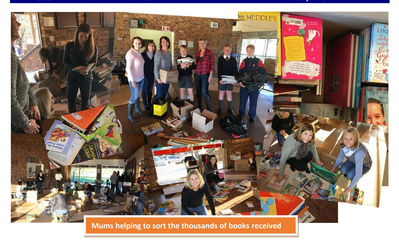
THANK YOU to our St Peter's family for your most generous contribution of books and volunteering for Mandela Day. It is only together that we make a difference in our country!

THROUGH THE KEYHOLE SENIOR PREP 26 July 2018