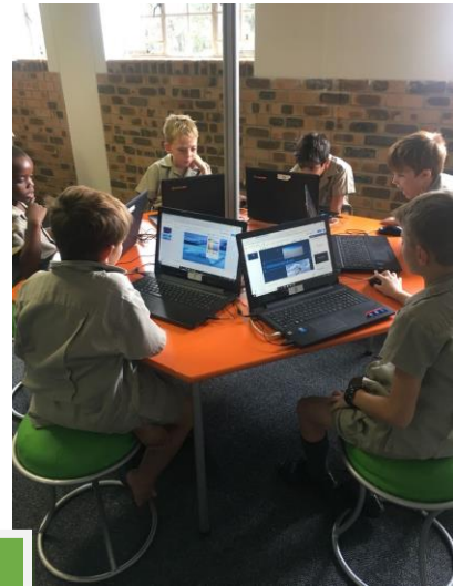
The Grade 3s creating Google slides for the first time!