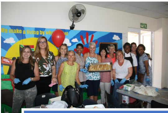
Delicious Pancakes – thanks mums!