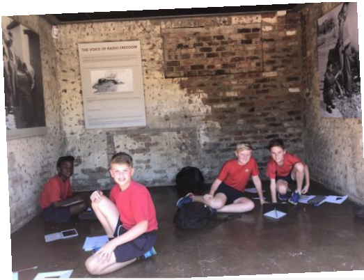
Grade 6 Boys at Liliesleaf, learning about Apartheid and Democracy