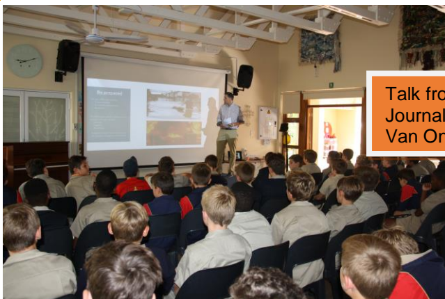
Talk from Journalist, Peter Van Onselen