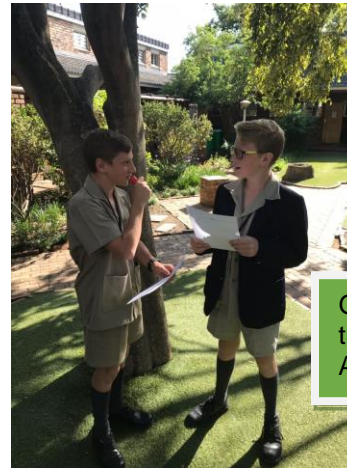
Grade 7s working on their interview for Afrikaans