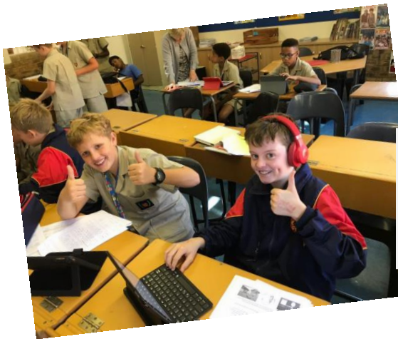
Grade 7s enjoying writing their news article for English