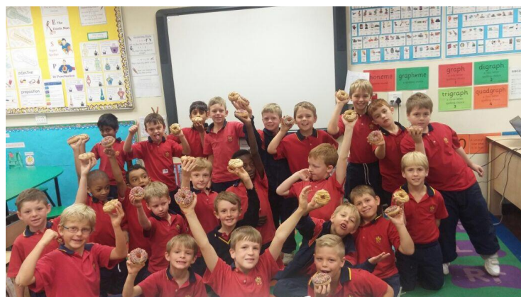
Grade 2 VM – Junior Prep Winners!