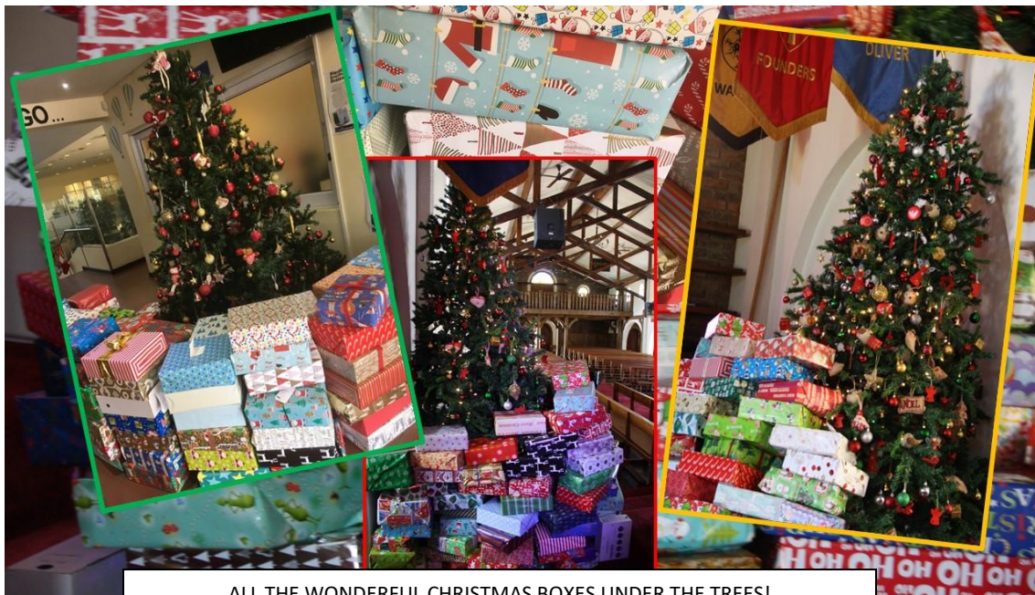
ALL THE WONDERFUL CHRISTMAS BOXES UNDER THE TREES! THANK YOU ST PETER'S FAMILY

To sign up for individual music instrumental lessons, please click on the link below. This will take you to the St Peter's Website which will give you more information as to what is on offer. You will be able to click on the Google form link which will take you to the Music Application form.