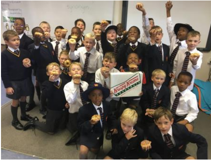
Grade 3 SC - Senior Prep Winners

Please do join us at the Autumn Carnival on Saturday, 27 May, it promises to be a great afternoon of fun for all.