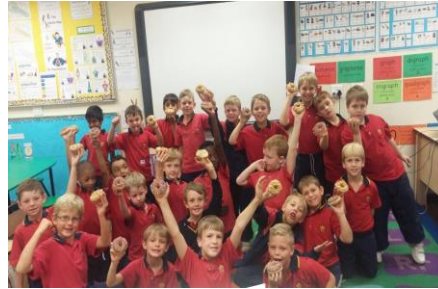
Grade 2 VM – Junior Prep Winners!