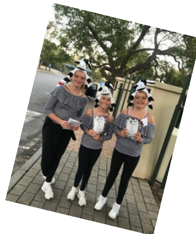
Very enthusiastic St Peter's pupils handing out flyers for The High Roller Rodeo for The Cows Fundraising Night!