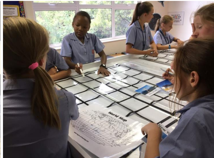
Using Coding to consolidate learning in longitude and latitude