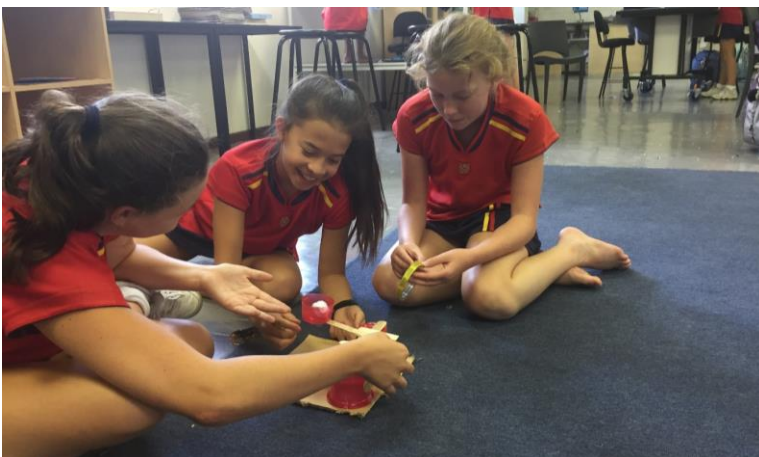
Making a device to throw a ball in STEM