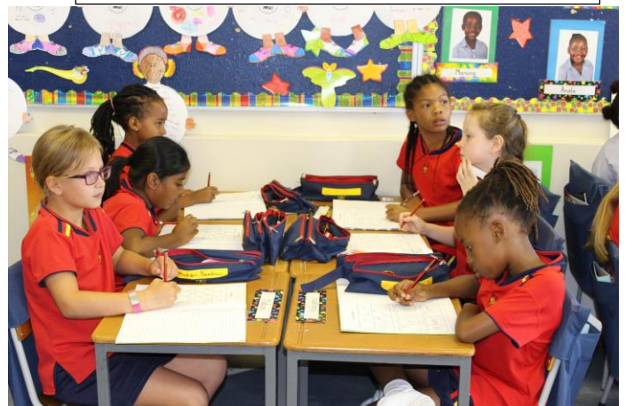
2018 is well under way in classrooms